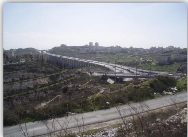
A wide, well maintained highway connecting illegal Israeli settlements in East Jerusalem, as seen from the settlement of Pisgat Zeev, coming from the settlement of French Hill. Expanding Jewish-only infrastructure in the Palestinian occupied territory is an essential factor in the Israeli matrix of control of the land.